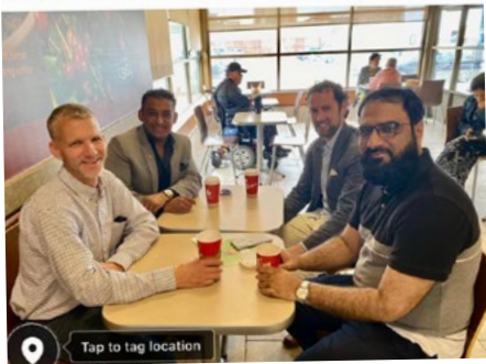
This is what a town councillor tweeted after we had coffee with him and a local imam. He quoted from the Quran, are we as quick to quote the Bible?"

Quran, Surah 49:13 "O mankind! Surely We have created you from a male and female, and made you into tribes and families so that you may know one another (and so build mutuality and co-operative relationships, not so that you may take pride in your differences of race or social rank."