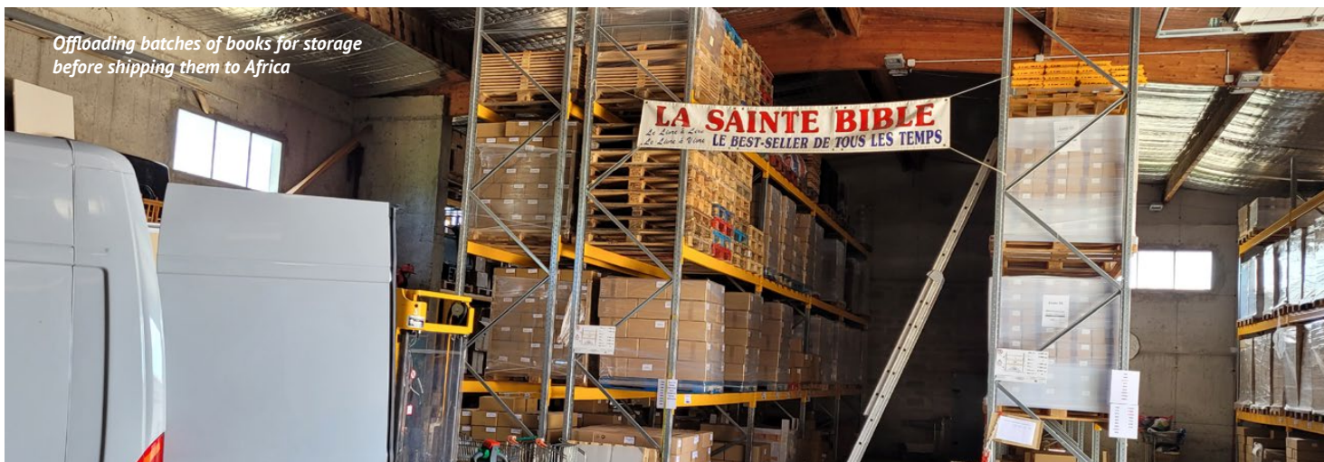
Offloading batches of books for storage before shipping them to Africa

I am soon on my way to the U.S.A. to attend the Reformed Faith and Life annual meetings scheduled at Mid-America Reformed Seminary. I will be preaching at Oak Glen URC in Lansing Ill (being an associate pastor there), also speaking during a RCUS church conference held in Aberdeen (SD) the theme is: Calvin's relevance for the Church today).