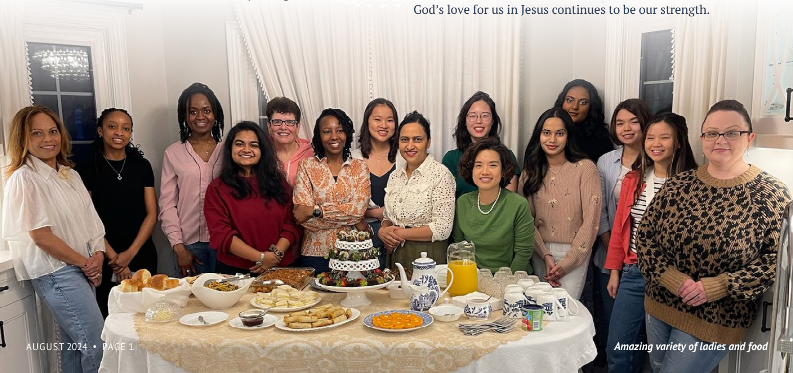
Amazing variety of ladies and food

Continue to stand with our united congregation in prayer, encouragement, and financial support. (The 1st two don't cost a dime and they are more essential.) May Christ's kingdom come. God's love for us in Jesus continues to be our strength.