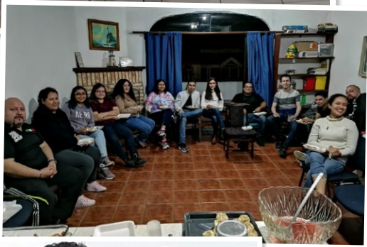
Young People’s Christmas Party