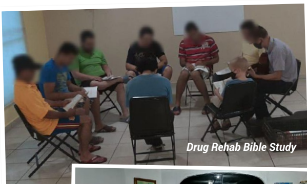
Drug Rehab Bible Study